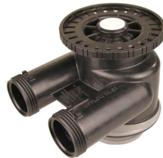
Order No. D1220-01RT

ALL PARTS INCLUDED AS SHOWN EXCEPT FOR IN/OUT HEAD