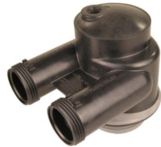
Order No. D1220RT