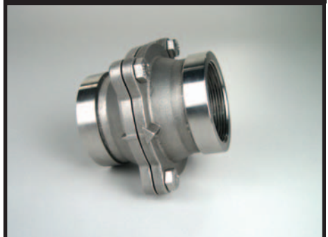
Order No. V3051