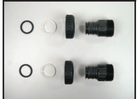
Order No. V3007-05