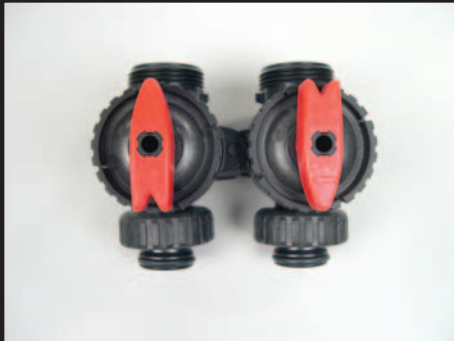
Order No. V3006