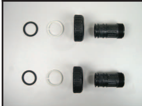
Order No. V3007-04