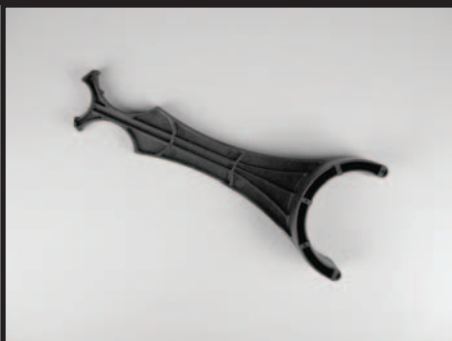
Order No. V3193-01