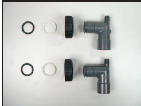
Order No. V3007-01