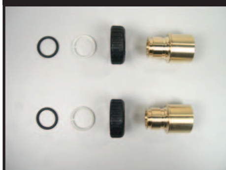
Order No. V3007-09