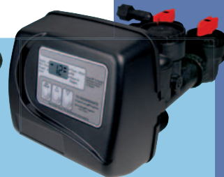
WS1TC* 102 lpm 27 gpm