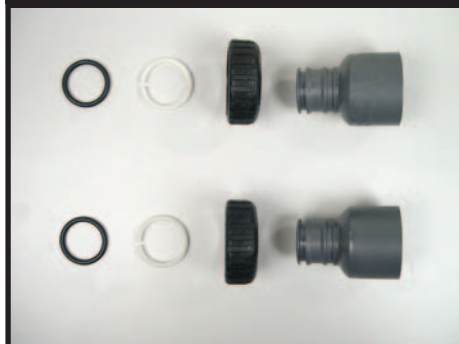
Order No. V3007-07