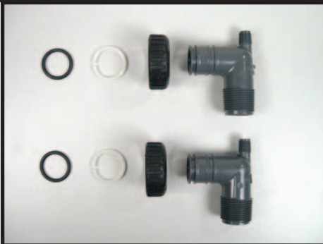
Order No. V3007