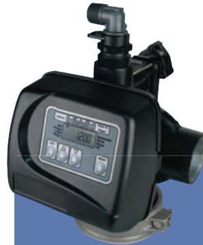
WS2LEI 284 lpm 75 gpm