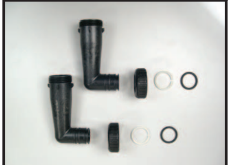
Order No. V3191-01