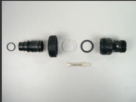
Order No. V3008-02