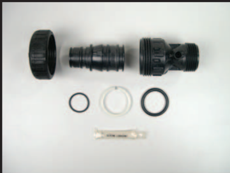
Order No. V3008-04