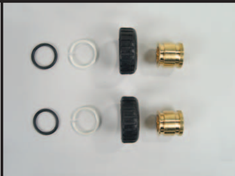
Order No. V3007-03