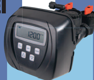
WS1.25CI* 129 lpm 34 gpm