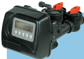
WS1* 102 lpm 27 gpm