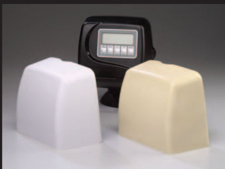
V3175WC-W • V3175WC-A