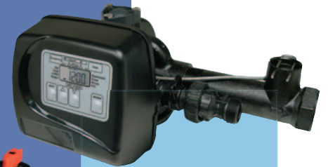
WS1.5EI* 227 lpm 60 gpm