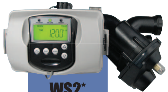
WS2* 472 lpm 125 gpm