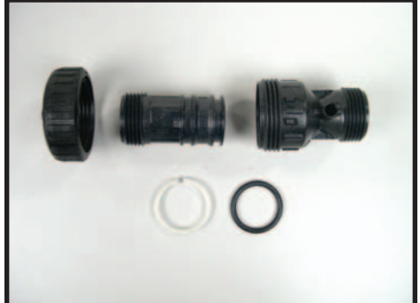
Order No. V3008-03