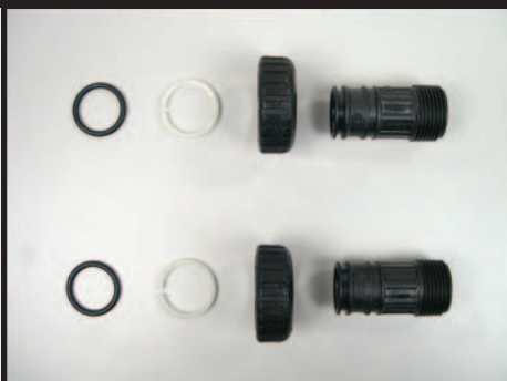
Order No. V3007-06