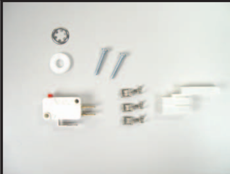
Order No. V3009